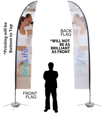
Fabric is Mesh see through Flag Polyester Banner Image is printed on 1 side of the banner (left to right) for single sided display. The back side shows the mirror image of the front side.

Your association logo and/or copy can be added to the displays.